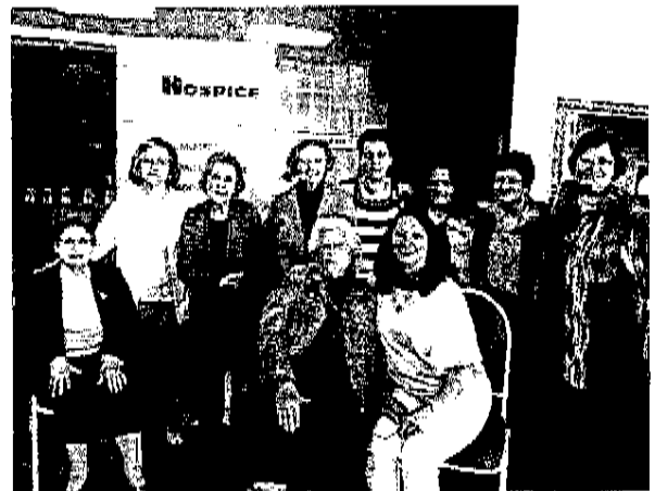
The Hellenic Society of Benoni very kindly hosted our Volunteer's "thank you" tea once again this year

We at Hospice are blessed to have a wonderful family of special helpers, of which 60% are volunteers. These are the people who enable Hospice East Rand able to continue with caring for terminally ill people. Hospice volunteers work in many different areas such as Daycare, the charity shops, the switchboard, hairdressers, the bookshop, caregivers who visit patients at home and in the In-Patient Unit and the Care Club members who assist with fundraising events. All people with a will to help Hospice. Recently the Greek Church in Benoni hosted a wonderful tea party for all the volunteers to show our gratitude and this was greatly appreciated by all our volunteers.