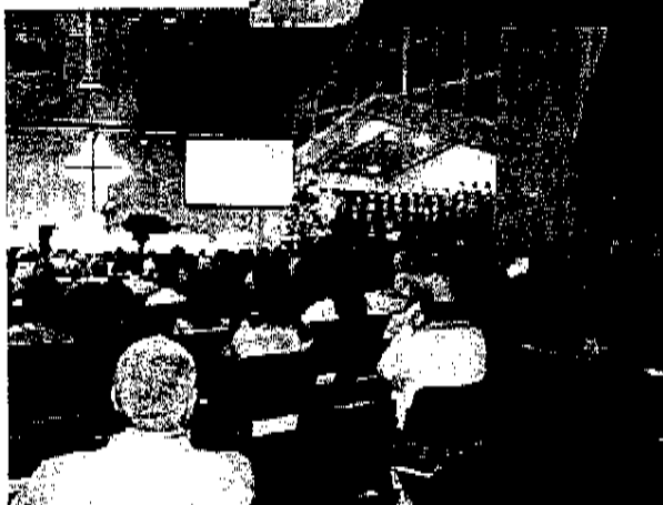
Tree of Memories