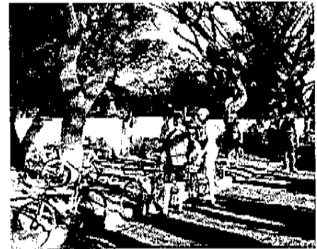
The Slipstreamers Cycling Club support our Hospice every year and we were delighted to receive a truck load of donated goods this year as well as a donation of R3000.00