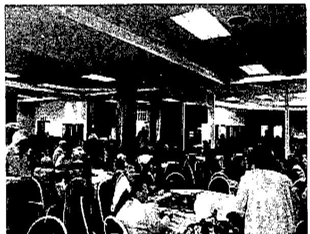
All our valuable volunteers were treated to a mouthwatering tea at the Greek Hall in Benoni in September this year to show our appreciation for their hard work and commitment.