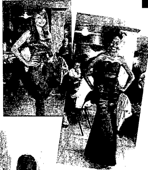
A model from Rampage Models showing off a beautiful garment at our fashion show at the Lifestyle Garden Centre in Kempton Park

Our recent fashion show held in partnership with Shirley Modlin of Chickita's Boutique and Rampage Models was greatly enjoyed by all who attended