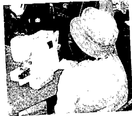
Some of the beautiful items made for sale at the Daycare Centre