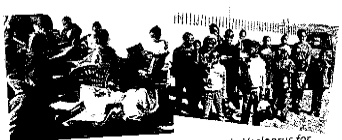
Our children's holiday programme in Vosloorus for children infected and affected by HIV/Aids